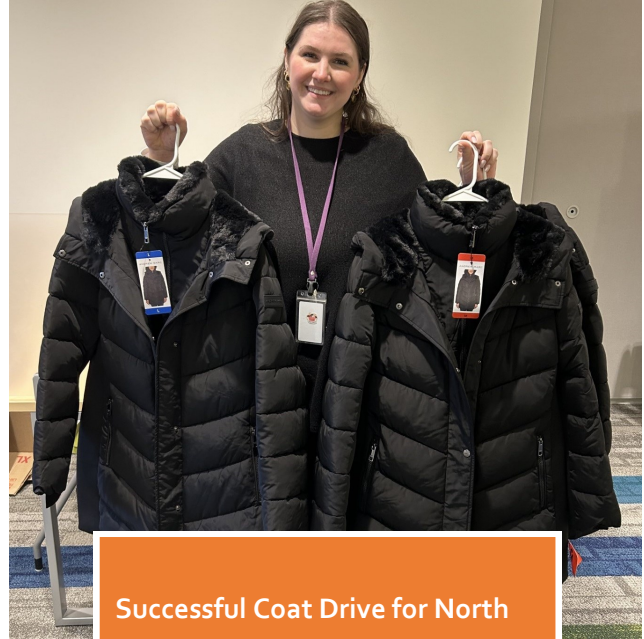
Successful Coat Drive for North Seattle Family Center (Now Akin)