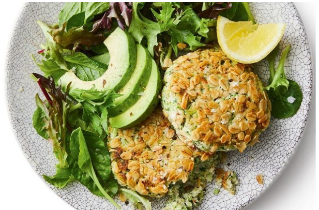
Adapted from Eating Well

Prepare crab cakes in a large bowl. Whisk together egg white, mayonnaise dressing, mustard, and hot pepper sauce. Stir in sweet pepper, parsley, green onion, and dill. Add crab and 1/2 cup of the bread crumbs; stir until well mixed. Using wet hands, shape mixture into six 1/2-inch-thick patties. Place in a 15x10x1-inch baking pan. Cover with foil or plastic wrap and chill for 30 minutes. Preheat oven to 300 degrees F. Place remaining 3/4 cup bread crumbs in a shallow dish. Dip crab cakes in bread crumbs, turning to coat both sides. Coat an unheated large nonstick skillet with nonstick cooking spray. Preheat over medium heat. Add three of the crab cakes. Cook for 8 to 10 minutes or until golden brown and heated through (160 degrees F), turning once halfway through cooking. Transfer to a baking sheet; keep warm in the oven. Repeat with remaining crab cakes. To serve, top salad greens and avocado with warm crab cakes and serve. Toss greens mixture with dressing; divide among six serving plates. Top with warm crab cakes. If desired, garnish with lemon or lime wedges.