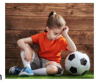
plate. Sever's disease or calcaneal apophysitis is most commonly experienced in youth athletes, particularly those involved in soccer, track, or basketball. Unlike adult heel pain it doesn't subside immediately once the activity stops.

Sever's disease is a condition that affects kids between the ages of 8-14. Pain can be felt at the back or the bottom of the heel as a result of inflammation of the growth