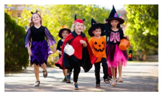
Halloween Safety Tips

Swift treatment is safe for everyone. It's a great treatment for kids because pain is minimal and doesn't last.